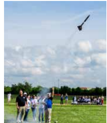
Students launch rockets at HCC Northeast College