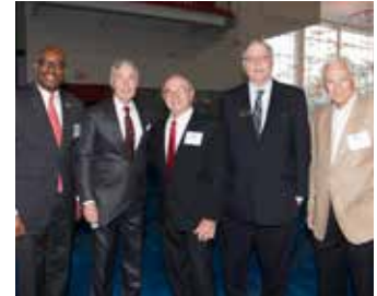
HCC State of the College