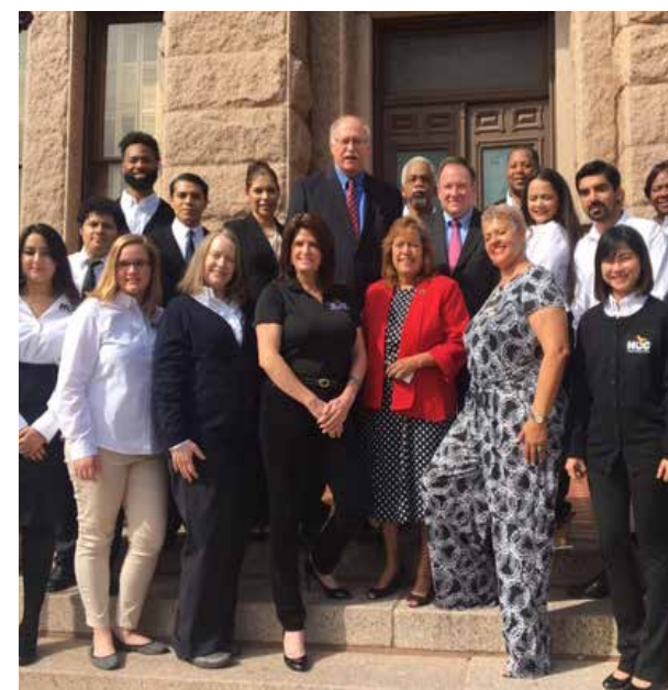
HCC participated in the 2017 Texas Community College Day in Austin, Texas. Students and trustees met both state representatives and senators to learn about current legislation and how the state government works.