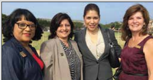
Partners in Education

BUILDING Partnerships for Student Success